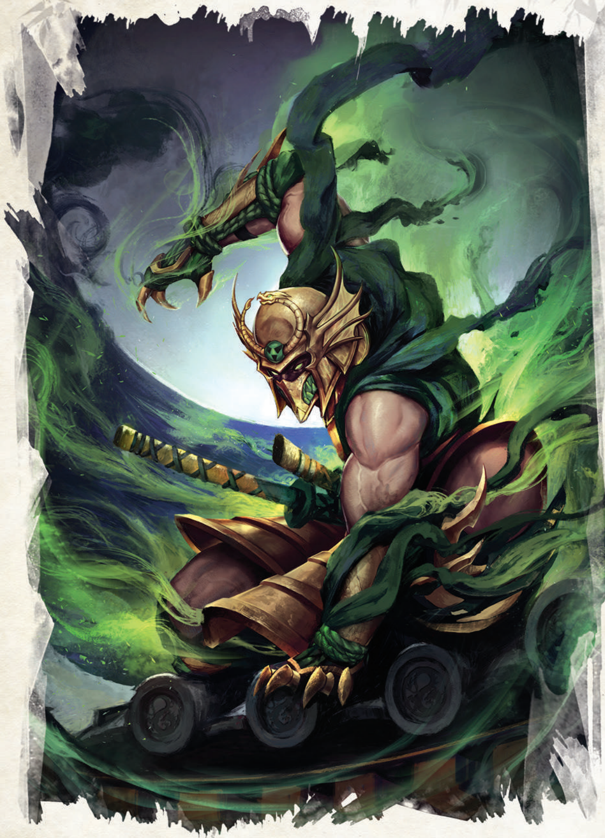
Togashi Yokuni - Enigmatic Champion of the Dragon Clan